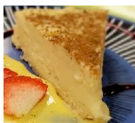
Melk Tert Vanilla Milk Pudding