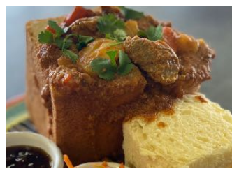
Bunny Chow - $24.95 Lamb (+$2), Chicken or Veg (V)