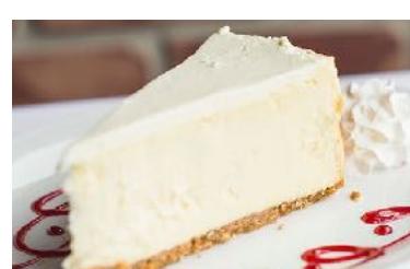
Cheesecake Steakhouse Cut