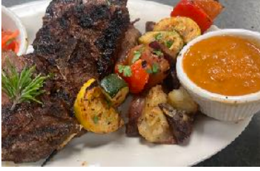
Lamb Chops (3) - $34.95 Karoo Seasoned Lamb Chops