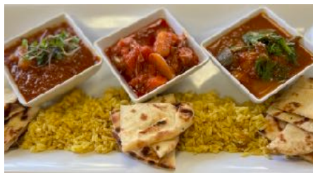
Curry Sampler - $26.95 Choice of 3 curries w/ rice or naan