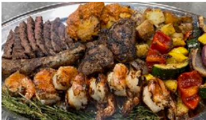
Mixed Grill for 2 - $79.95 Lamb & pork chops (or chicken thighs), sirloin, shrimp & Boerewors plus a choice of side.