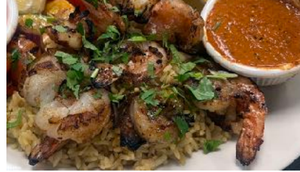
Jumbo Shrimp (8) - $29.95 Garlic Lemon Peri-Peri Seasoned