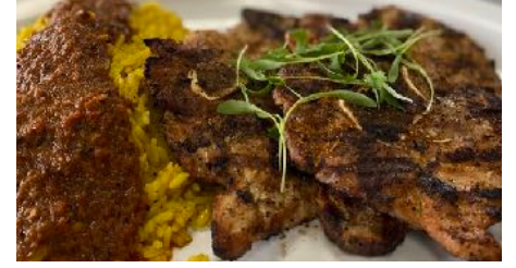
Pork Chops (3) - $26.95 Garlic Lemon Peri-Peri Seasoned