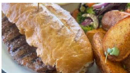
Peri-Peri Steak Roll - $26.95 Peri-Peri 8oz Top Sirloin Steak on Toasted French Roll