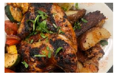
Whole Baby Chicken - $26.95 Peri Peri Cornish Chicken