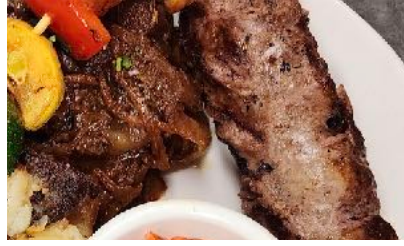
Lamb Chop (2) & Boerewors-$29.95 Karoo & Boerewors Seasoned