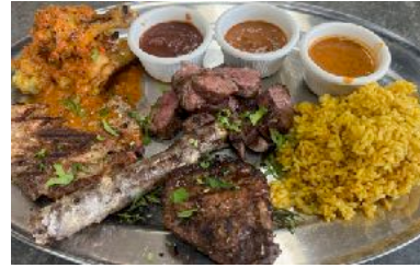
Chef's Sampler - $44.95 Lamb & pork chop (or chicken thigh, Boerewors, Sirloin, 4 wings, plus a choice of side.