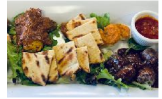
App Sampler for 2 - $21.95 Peri Peri wings (6), shrimp (4), boërewors bites (4), naan bread & curry sauce