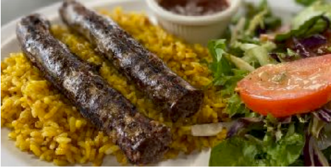
Boerewors (2 x 8oz) - $26.95 Served w/ Peri-mustard