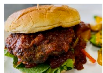
Safari Burger - $21.95 Beef, Beef/Pork, Chicken Breast or Beyond Beef (+$2) (V) w/ Monkey Gland Sauce