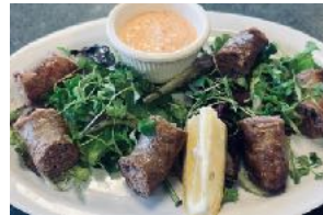
Boërewors Bites - $12.95 Grilled Farmers Sausage Bites choice of sauce