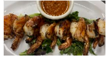
Grilled Peri-Peri Shrimp (6) - $14.95 Choice of sauce