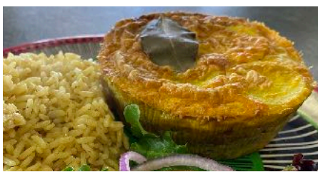
Bobotie Casserole - $24.95 Ground Beef w/ Béchamel Topping