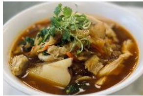
Chakalaka Soup - $9.95 Cup of chakalaka Soup (V) Bowl (+5). Add chicken (+$2).