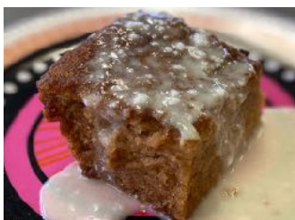
Malva Pudding Hot Apricot Cake w/ Custard