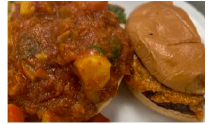
Veg. Sampler (V) - $26.95 1/2 Peri Peri Beyond Beef, Veg Curry w/ rice or naan, Mixed Vegetables

Take Home Products (Retail) All sauces & seasonings Biltong and Dröewors Frozen Boerewors (2lbs) & curries