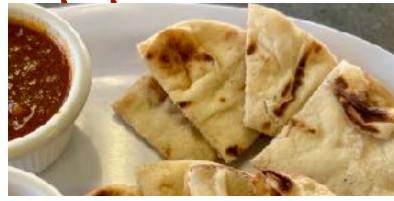
Naan Bread & Curry - $9.95 Choice of Curry Sauce (V)