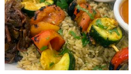
Kebabs (2) - $19.95 Beef, Beef/Pork, Chicken, Beyond Beef (+$2), Vegetables (V)