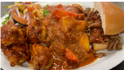
Dinner Sampler for 1 - $26.95 3 wings, 1/2 Sandwich of choice, choice of 1/2 curry w/ rice or naan.