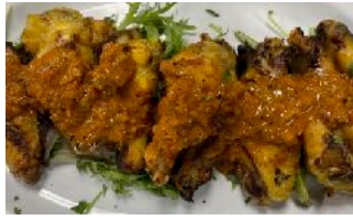
Chicken Wings - $12.95 served with choice of sauce