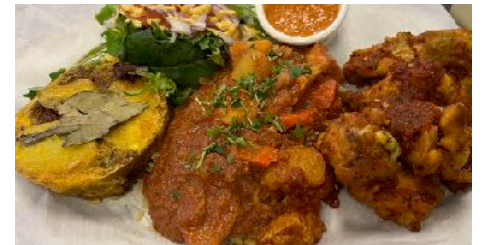
SA Dinner for 2 - $54.95 6 Wings, Bobotie Casserole, Choice of curry on rice or naan, plus a choice of side.